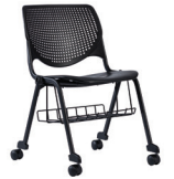
UNDERSEAT BASKET Optional