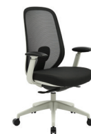
LIGHT GREY FRAME with optional arms

799-2-M3 Light Grey frame/Black mesh/Black seat 799-3-M3 Black frame/Black mesh/Grey seat