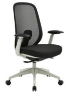
LIGHT GREY FRAME with optional arms

799-2-M3 Light Grey frame/Black mesh/Black seat 799-3-M3 Black frame/Black mesh/Grey seat