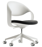
WHITE FRAME Black seat

CONTOURED POLYPROPYLENE moulded shell for comfort.