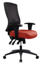
WITH ARMS Burnt Red