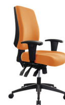
WITH ARMS Sunrise