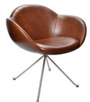
4 STAR BASE Custom