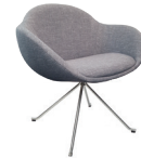
4 STAR BASE Keylargo, Ash