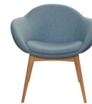
4 LEG WOOD BASE Custom