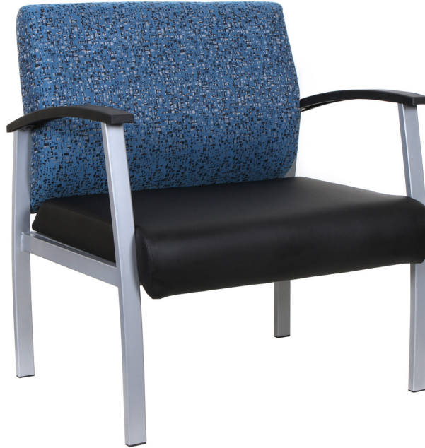
Featured in customer specified fabric