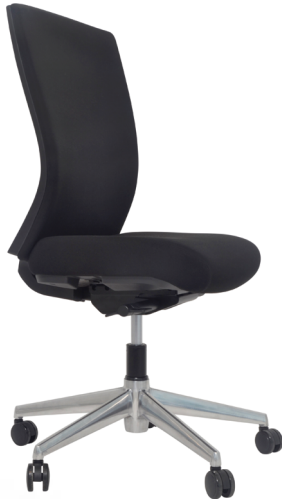
Buro Mentor chair with polished base