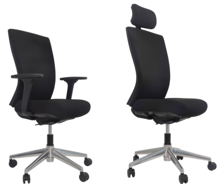
Featured with arms