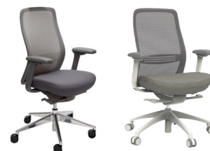
LUNA GREY Polished Aluminium base & 4D Arms