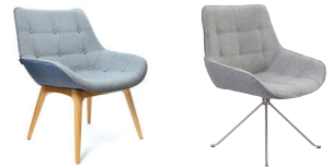
4 LEG WOOD BASE Custom upholstery with buttons