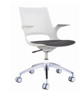
5 STAR Light Grey

CONTOURED POLYPROPYLENE moulded shell for comfort.