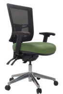
WITH ARMS SafeTex Olive