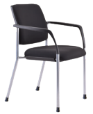
SILVER FRAME With glides

COMFORTABLE SEAT AND BACK Polyurethane moulded foam for your comfort.