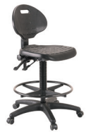
ARCHITECTURAL GAS LIFT with Black P/C Foot Ring