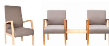
HIGH BACK custom upholstery