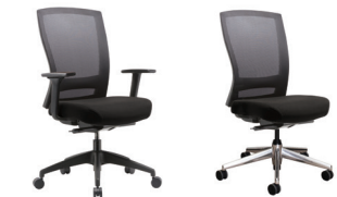
NYLON BASE Arms

Adjusts the seat depth to accommodate taller users and/or longer leg lengths.