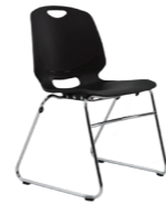
CHAIR Black shell, Silver P/C frame