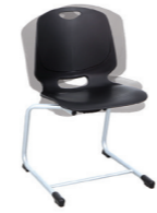
WITH 3D MOUNTING MECHANISM