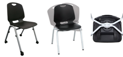
WITH CASTORS Black 3D MOUNTING MECHANISM Optional