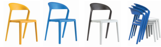
DUOBLOCK Yellow/Yellow DUOBLOCK Blue/Blue DUOBLOCK Grey/Black DUOBLOCK Stacked